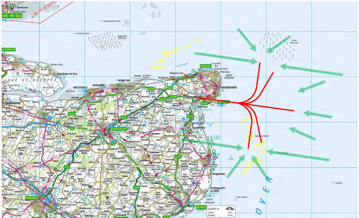
Figure 5 – Runway 28 Approach

Contains OS data © Crown Copyright and Database right 2020. All rights reserved.