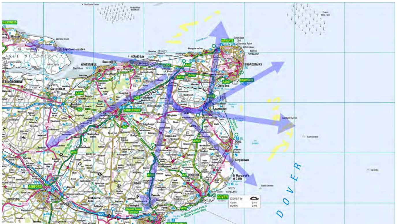
Figure 1 – Runway 28 Left-Hand Departures

Contains OS data © Crown Copyright and Database right 2020. All rights reserved.