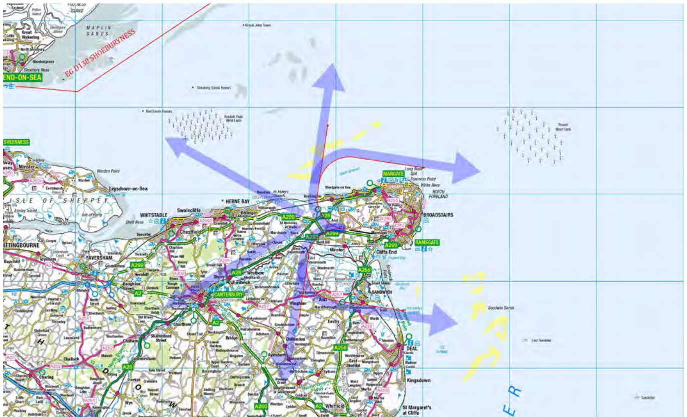
Figure 6 – Runway 28 Missed Approach