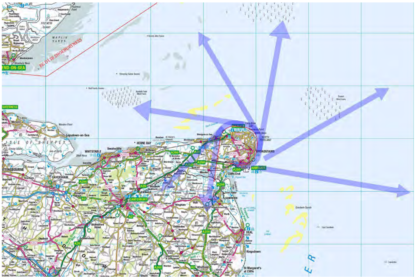
Figure 3 – Runway 10 Left-Hand Departures