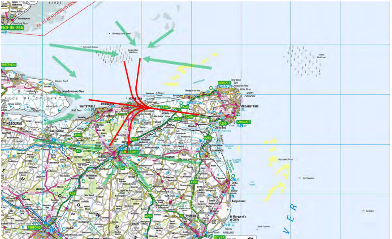
Figure 7 – Runway 10 Approach

Contains OS data © Crown Copyright and Database right 2020. All rights reserved.