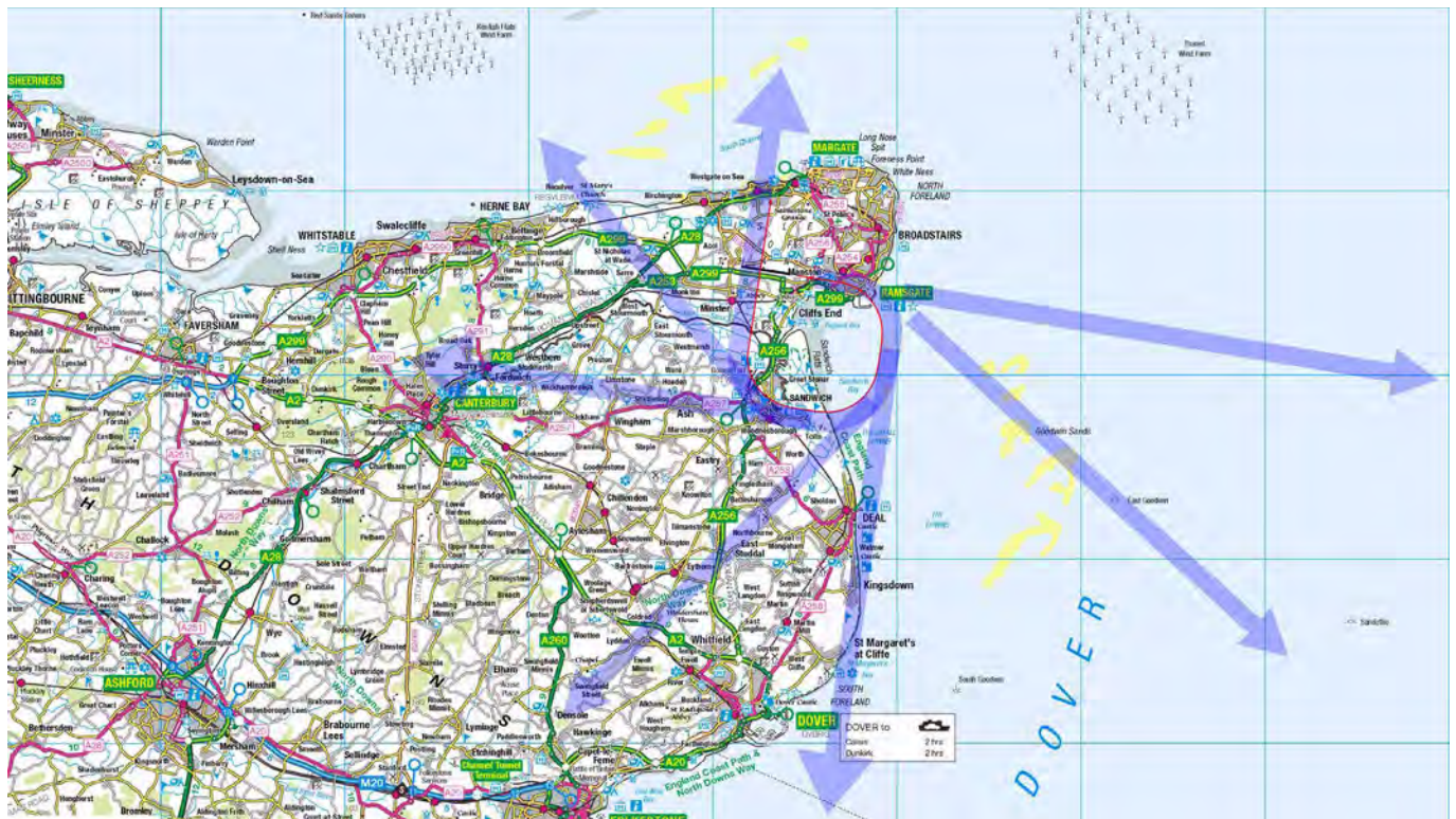
Figure 4 – Runway 10 Right-Hand Departures

Contains OS data © Crown Copyright and Database right 2020. All rights reserved.