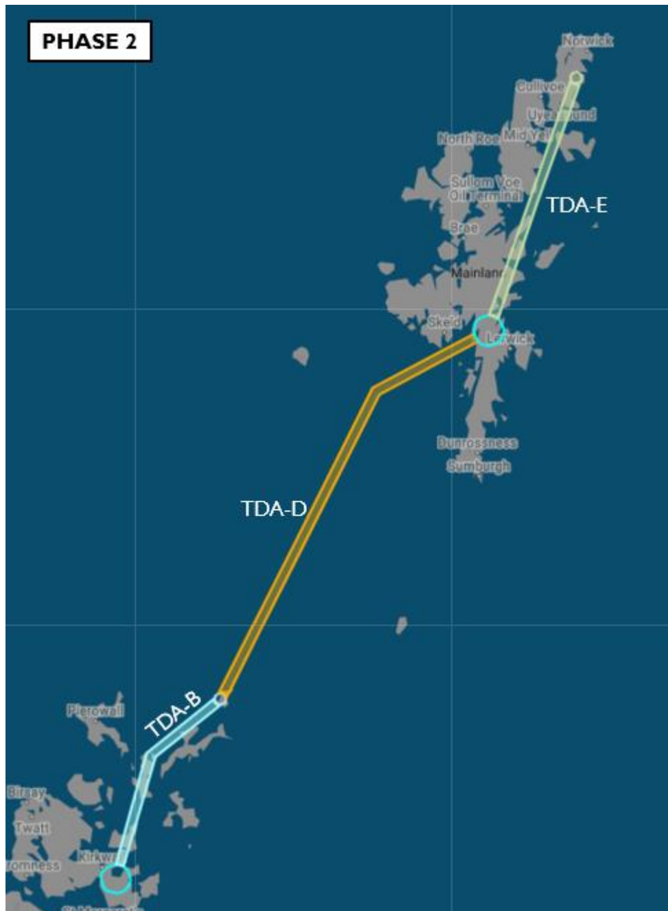
Figure 2 Geometry of TDA-B, TDA-D, TDA-E used in PHASE 1 of ACP-2021-025.