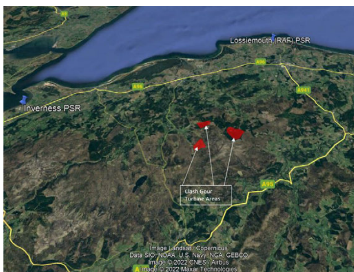
Figure 1 Clash Gour Wind Farm Location

Force9 Energy (Force9), jointly with EDF Energy Renewables Limited (EDFER) is developing the Clash Gour Wind Farm (Clash Gour) in the name of its wholly owned subsidiary Clash Gour Holdings (CGH). Clash Gour will be a substantial onshore windfarm which will be located in the Moray Council Area, approximately 13 Nautical Miles (NM) southwest of RAF Lossiemouth and 15 NM southeast of Inverness Airport. Clash Gour will consist of 48 wind turbines with a maximum blade tip height of 180 metres (m) above ground level (agl). Figure 1 below provides the location of the three individual wind turbine array areas which will comprise Clash Gour.