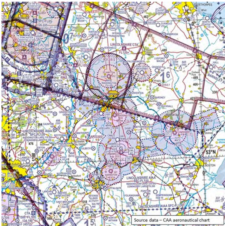
Figure 2– Local Area Airspace