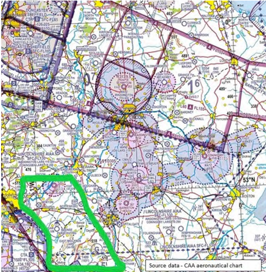
Figure 3 – Langar Skydive Operating Area