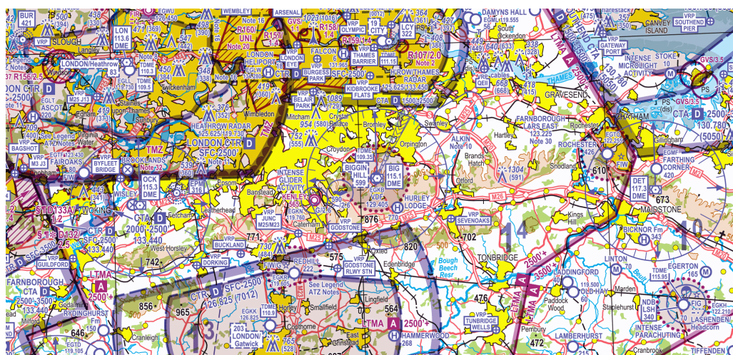
Figure 1 – Biggin Hill Airport Local Area

The Do Nothing option represents the current situation at Biggin Hill Airport and will be used as the baseline against which all other options are measured. LBHA is situated in Class G, uncontrolled airspace; the only regulated airspace currently at LBHA is the Aerodrome Traffic Zone (ATZ) established to protect the airport's operations and all en-route traffic is required to avoid it unless permission has been granted to enter by LBHA. The LBHA ATZ is the airspace extending from the surface to a height of 2,000 ft above the level of the aerodrome within the area bounded by a circle centred on the mid-point of the runway and having a radius of 2.5 nm. Figure 1 below shows the location of LBHA in relation to the current surrounding airspace profile.