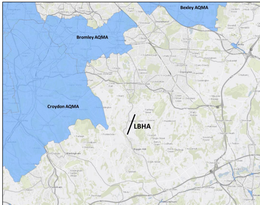
Figure 2 – Local Air Quality Management Areas