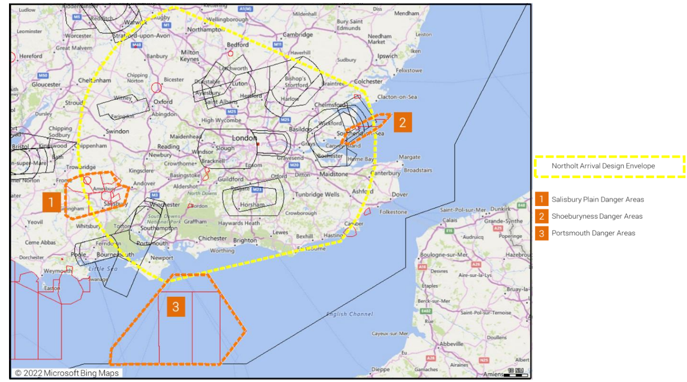
Figure 3 Northolt Design Envelope and design constraints - post engagement & SME development

3.3.5 The Northolt Design Concepts which were considered viable at this stage, within the Design Envelope presented, are shown in the Northolt Arrival Structure Viability Assessment below (Figure 4).