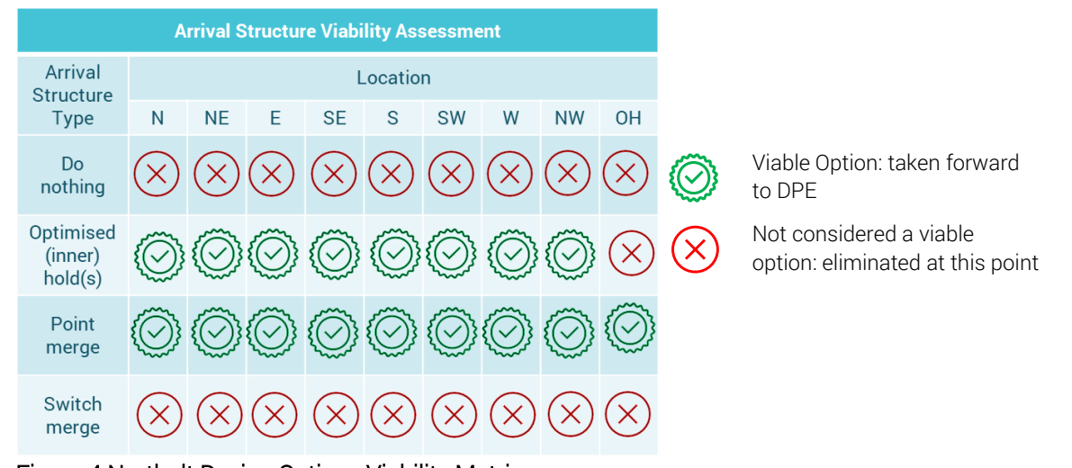
Figure 4 Northolt Design Options Viability Matrix

3.3.5 The Northolt Design Concepts which were considered viable at this stage, within the Design Envelope presented, are shown in the Northolt Arrival Structure Viability Assessment below (Figure 4).