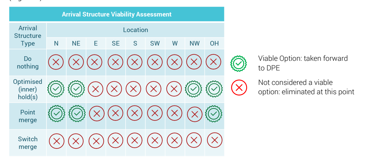
Figure 4 Stansted Design Options Viability Matrix

3.3.6 The Stansted Design Concepts which were considered viable at this stage, within the Design Envelope presented, are shown in the Stansted Arrival Structure Viability Assessment below (Figure 4).