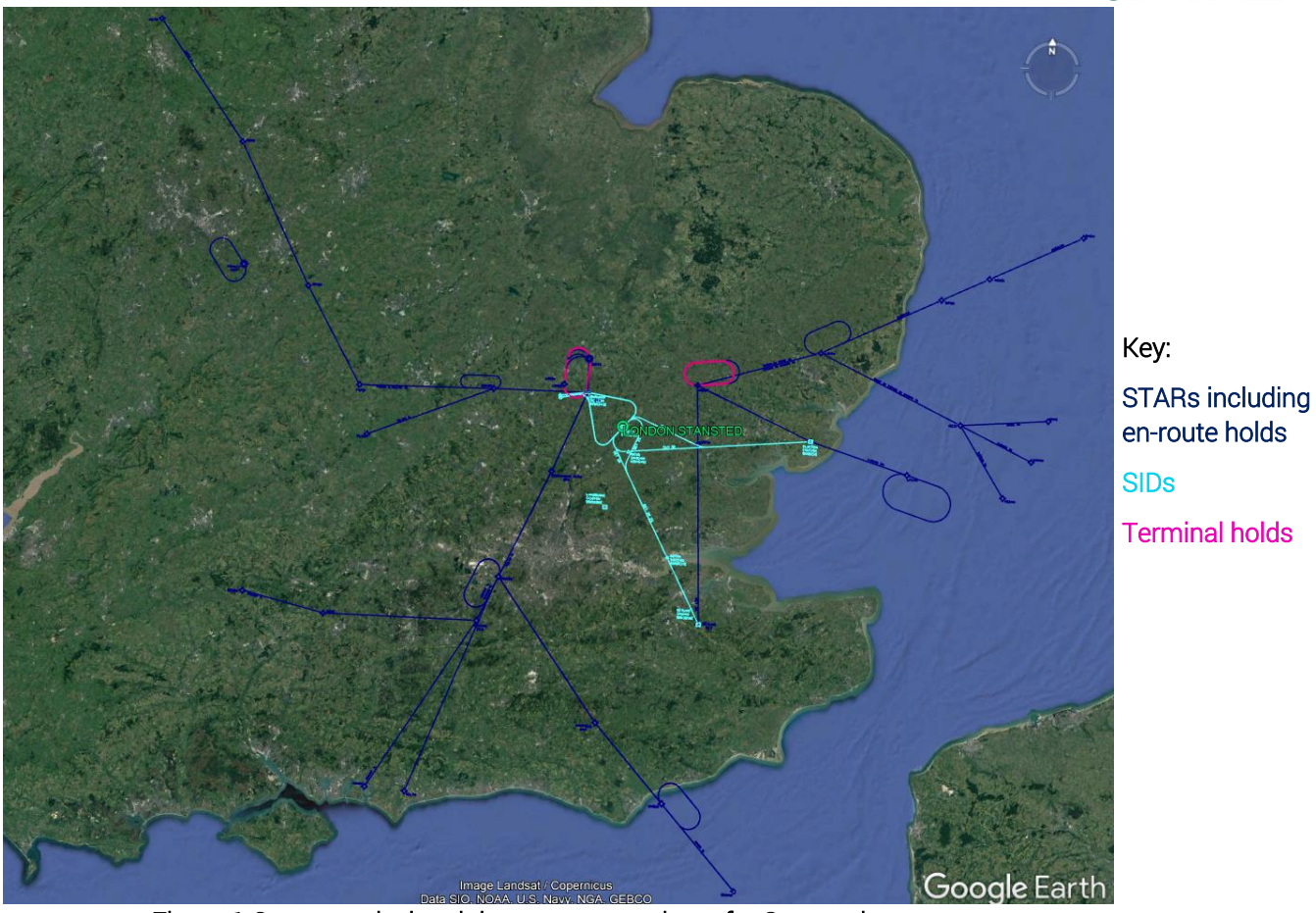
Figure 1 Current arrival and departure procedures for Stansted

2.1.5 Figure 2 shows a radar density plot of Stansted arrival traffic for a typical busy summer week and indicates traffic distribution. About half of Stansted traffic arrives from the east.