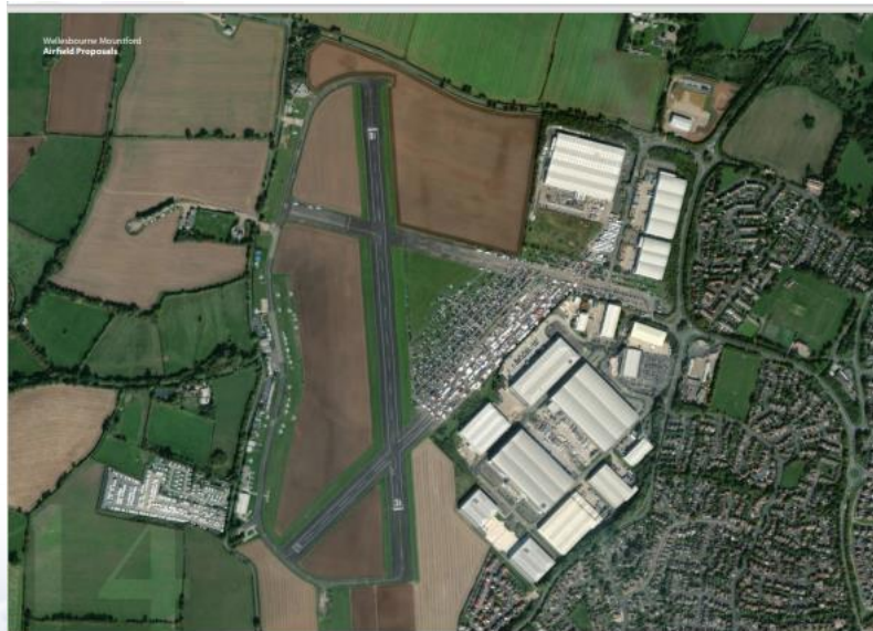
Aerial photograph showing position of market on the cross runway