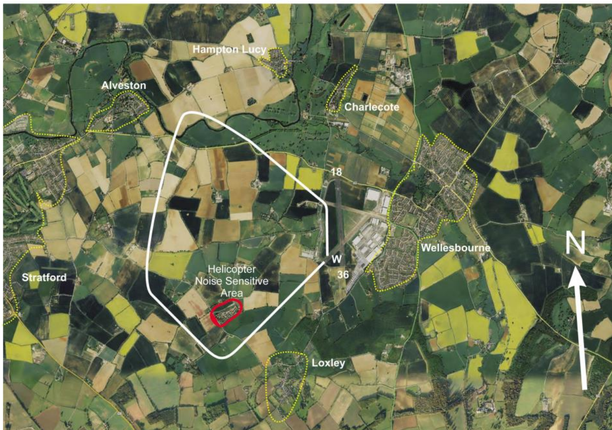
EGBW (Wellesbourne Mountford) Helicopter Visual Circuit - Runway 18/36