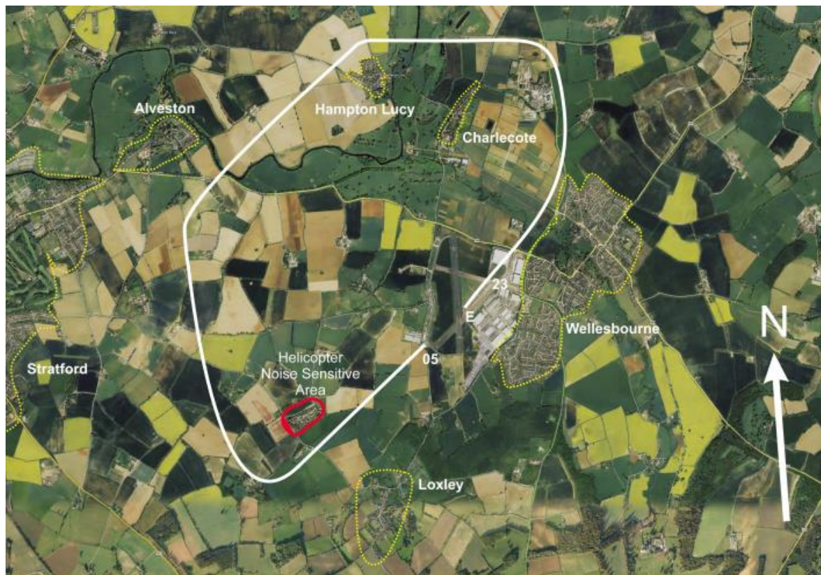
Wellesbourne Mountford Airfield