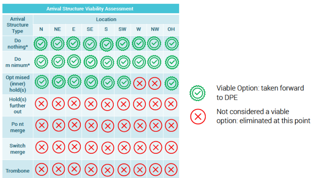
Figure 1 Engagement Initial Viability Matrix