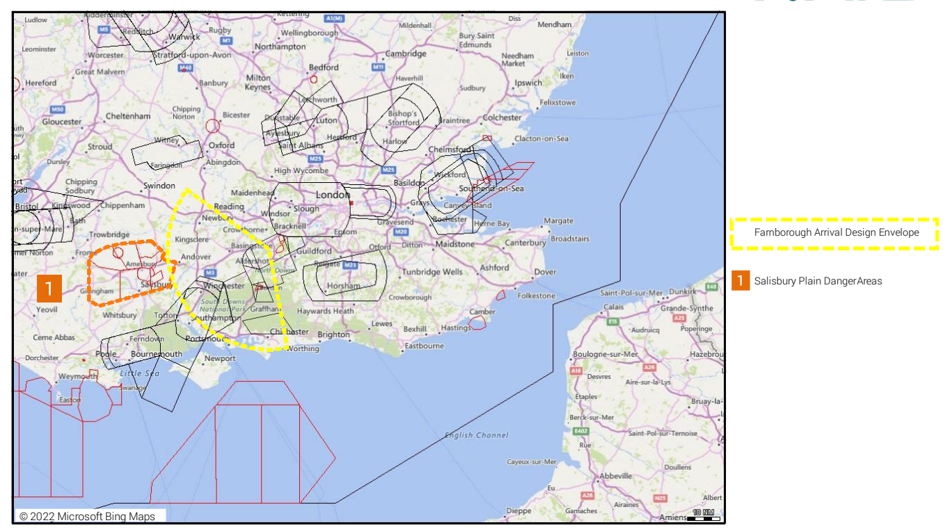
Figure 4 Farnborough Design Envelope & design constraints – post engagement and SME development

3.3.6 The Farnborough Design Concepts which were considered viable at this stage, within the Design Envelope presented, are shown in the Farnborough Arrival Structure Viability Assessment (Figure 5).