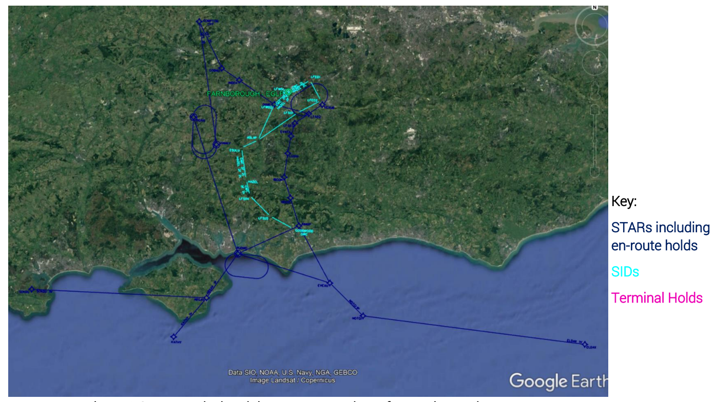
Figure 1 Current arrival and departure procedures for Farnborough

2.1.5 Figure 2 shows a radar density plot of Farnborough arrival traffic for a typical busy summer week<sup>4</sup> and indicates traffic distribution. About 50% arrives from the south and southeast.