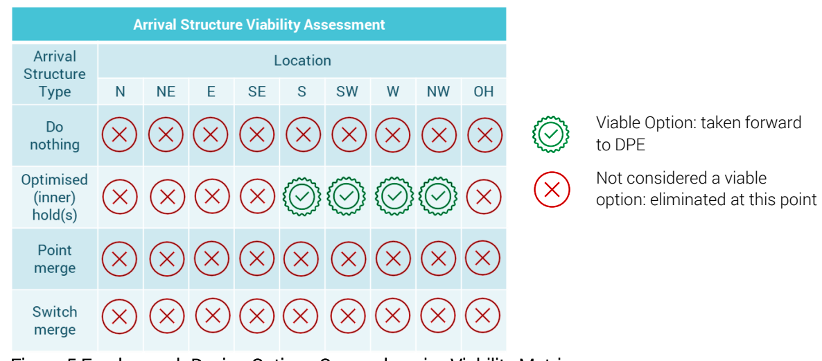
Figure 5 Farnborough Design Options Comprehensive Viability Matrix

3.3.6 The Farnborough Design Concepts which were considered viable at this stage, within the Design Envelope presented, are shown in the Farnborough Arrival Structure Viability Assessment (Figure 5).