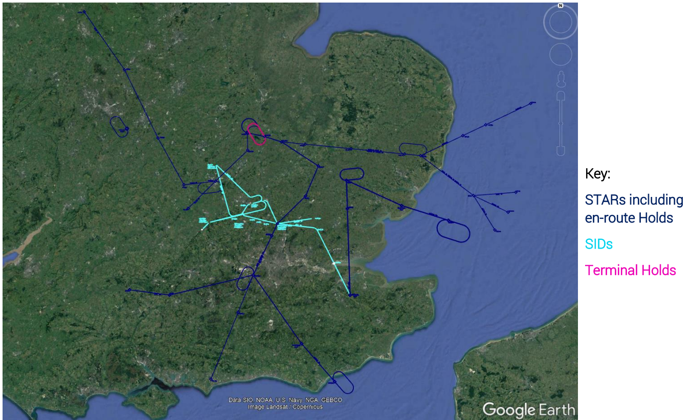
Figure 1 Current arrival and departure procedures for Luton

2.1.5 Figure 2 shows a radar density plot of Luton arrival traffic for a typical busy summer week 3 and indicates traffic distribution. About half of Luton's traffic arrives from the east.