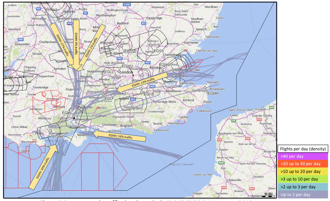
Figure 2 Bournemouth traffic density arrivals FL245-FL70 5-11 August 2019

2.1.5 Figure 2 shows a radar density plot of Bournemouth arrival traffic for a typical busy summer week and indicates traffic distribution. About 50% arrives from the south and southeast.