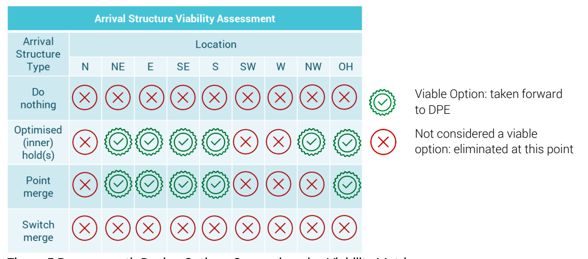
Figure 5 Bournemouth Design Options Comprehensive Viability Matrix

3.3.6 The Bournemouth Design Concepts which were considered viable at this stage, within the Design Envelope presented, are shown in the Bournemouth Arrival Structure Viability Assessment (Figure 5).