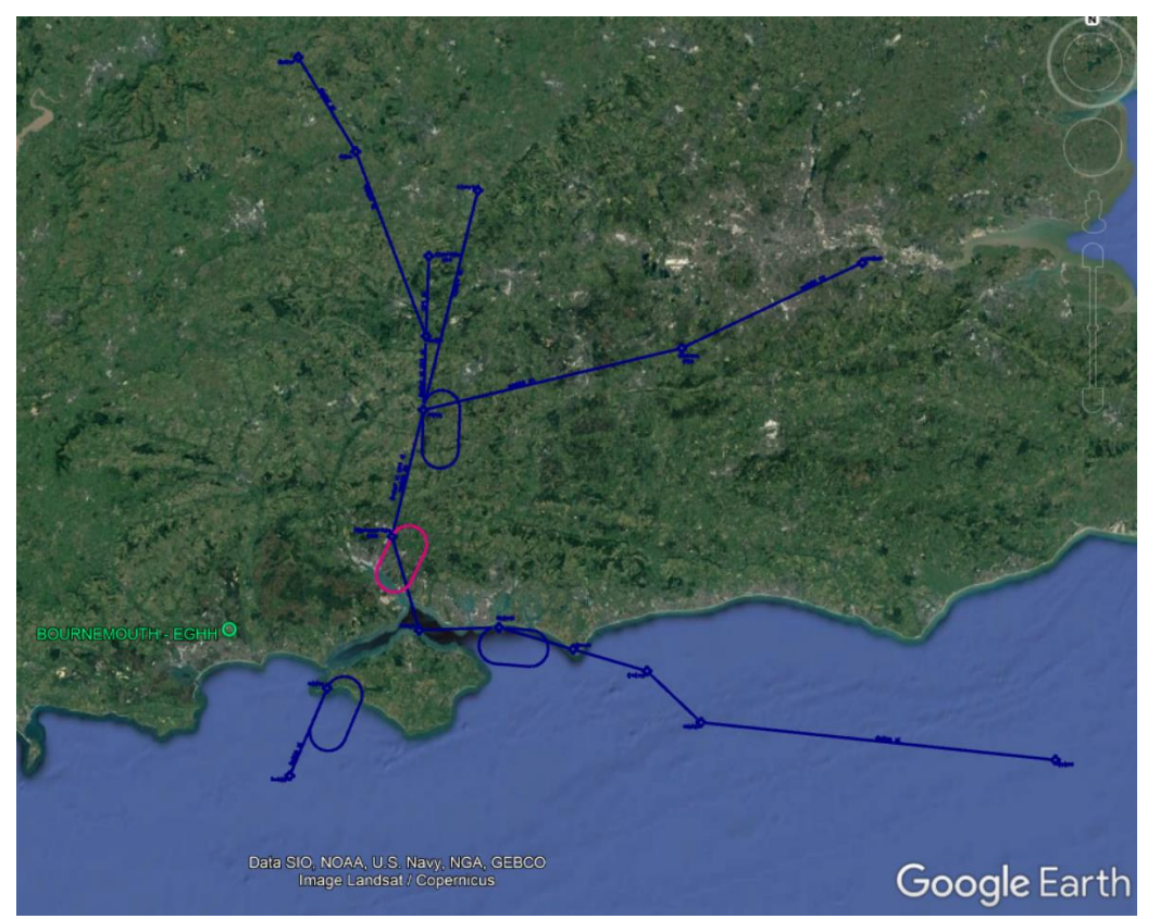
Key: STARs including en-route holds