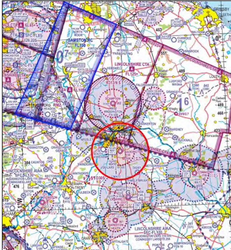
Airspace Design Option 1 LOW from ACP-2019-18