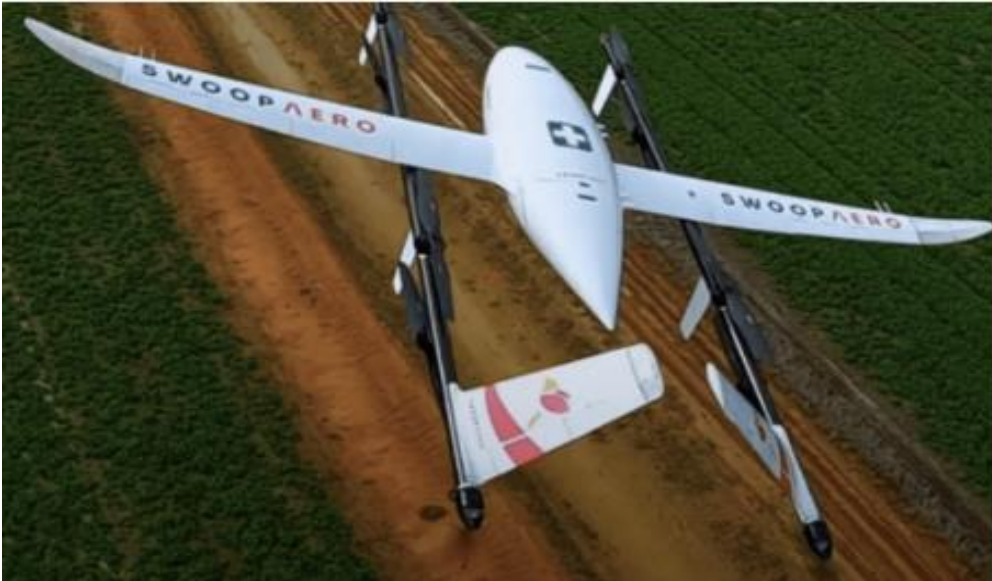
Figure1 - Swoop Kite EVTOL

14. An image of the Swoop Kite at Fig 1 and Table 2 below show the image and UAV specifications respectively.