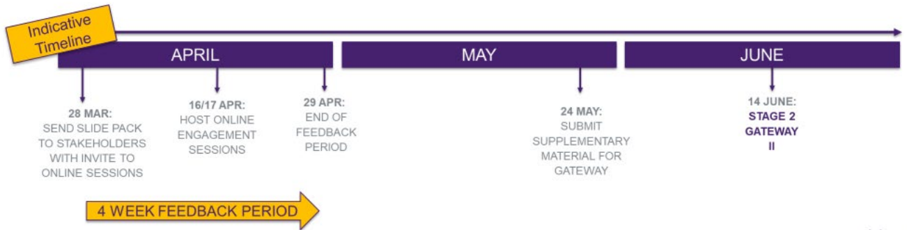
Figure 3: Indicative timeline for the re-engagement period shared with stakeholders

9.2.7 The record of attendance at the sessions is available below in Table 7. The invitations and associated email correspondence are available in Stakeholder Engagement Appendix H.