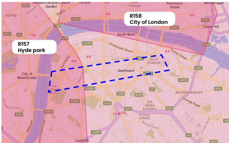
Figure 2 – Representation of the TRA dimensions and summary table